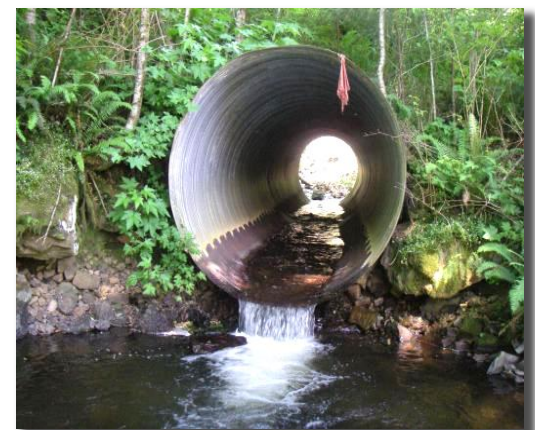
An undersized culvert ranked as “fully incompatible” that has significant downstream bed scour and bank erosion.

Fully Incompatible – The structure is severely undersized, impeding sediment transport, and causing streambed scour and bank erosion. Crossings in this category are not compatible with channel form or sediment transport process and are at a high risk of failure.