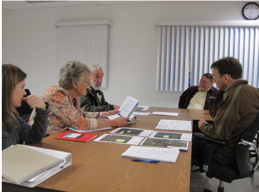
The subcommittee reviews plans.