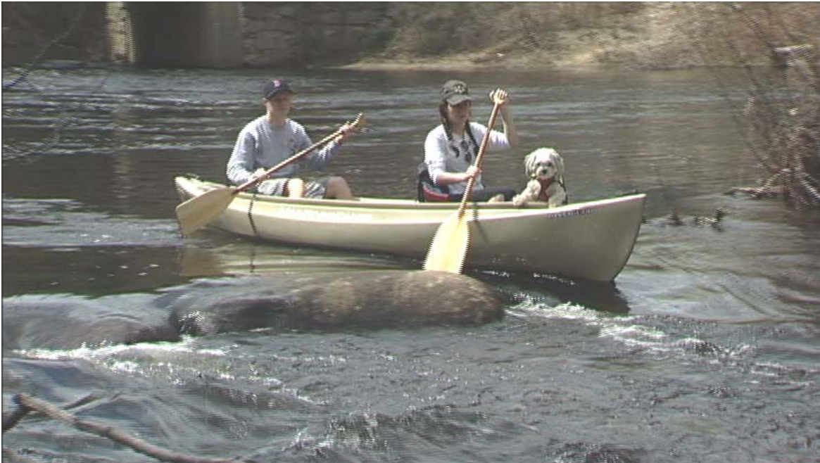
Visitors have a dog-gone good time on the river.