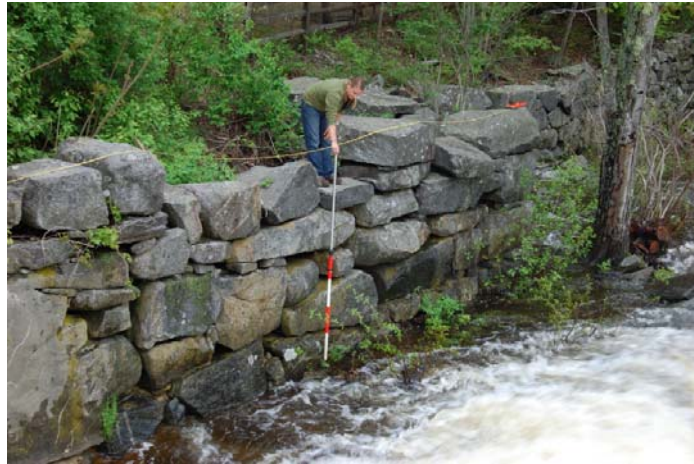
Historian documents the Wiswall Mill foundation in Durham prior to construction of the fish ladder.