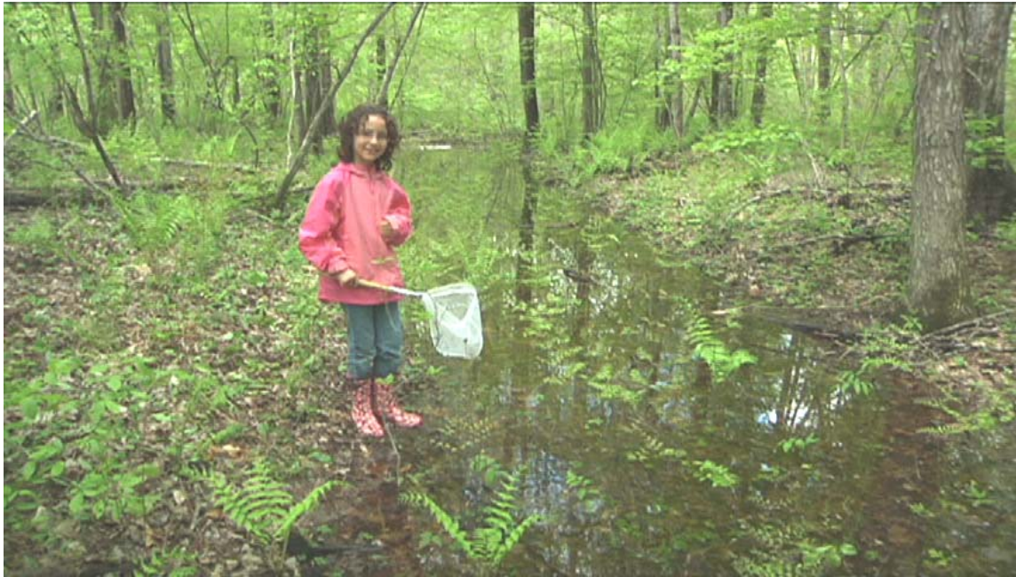
Future land steward enjoys the floodplain on conserved land in Lee.