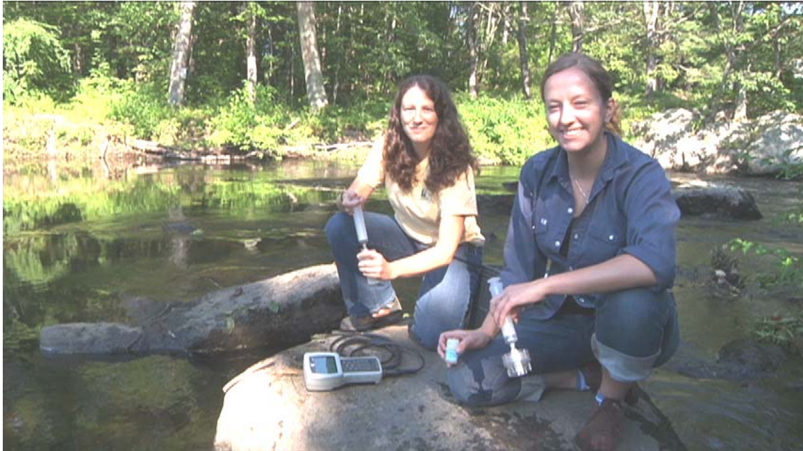
Scientists test the water.