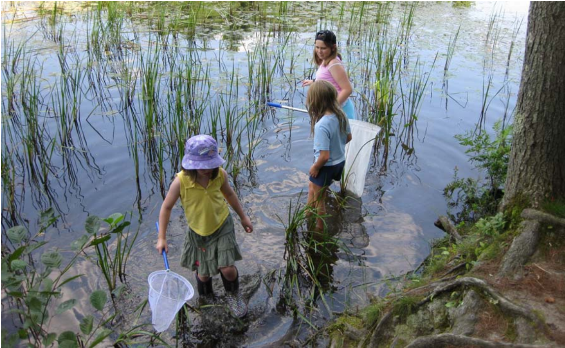
What can dragonflies teach us about the river?