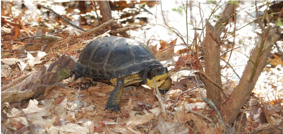
Blanding's turtle rests by a vernal pool.