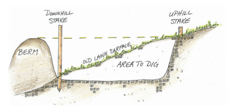
Figure 2. Where to dig and put the soil on a sloped site.

STEP 4. Set the berm height. Once you are close to having the entire garden area dug down to the "total depth to dig", hammer stakes along the perimeter of the rain garden about 4-6 feet apart, starting with the highest edge and working around the garden. Attach a string to the base of the highest stake. Use a string level to mark the leveled height on each stake around the perimeter of the garden. This will be your berm height.