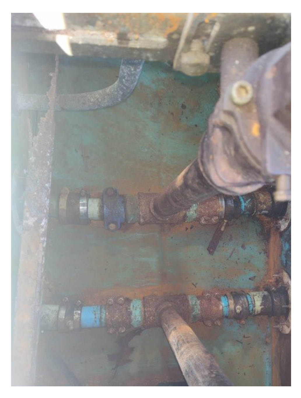
primary has a slit down the middle on the top part of the primary line inside dispenser.